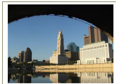
Future site of the Scioto Mile